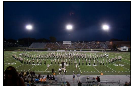
CHS Band halftime performance

Clay Memorial Stadium will have its Press Box renovated to accommodate the increase of the number of sporting events held in the stadium. Along with high school football, all junior high football and both boys and girls high school soccer matches are now played on the turf "under the lights". The current press box is the original structure from 1947, and cannot accommodate the needs of the coaching staff, announcers and media transmission crew (see picture below).