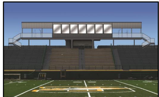
New Press Box & Observation Deck rendering on right